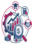
Finance and Accounting Training Courses