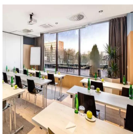
Prague - Czech Republic