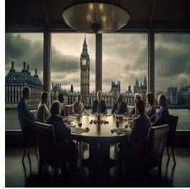
London - UK