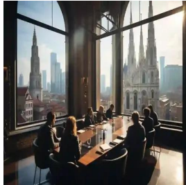
Milan - Italy