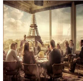
Paris - France