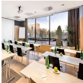
Prague - Czech Republic