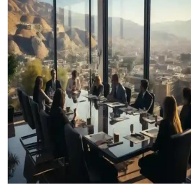
Amman - Jordan