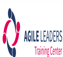
Cape town - South Africa