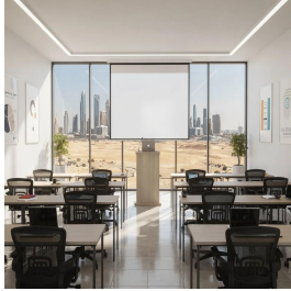
Abu Dhabi - UAE