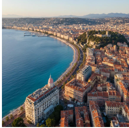
Nice - France