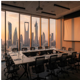
Riyadh - Saudi Arabia