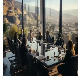
Amman - Jordan