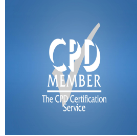
Certified Courses By International Bodies