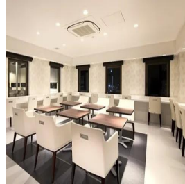
Tokyo - Japan