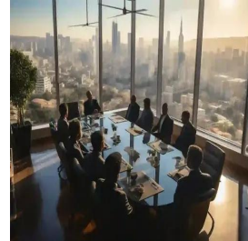
Baku - Azerbaijan