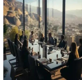
Amman - Jordan