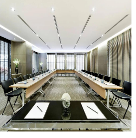
Nairobi - Kenya