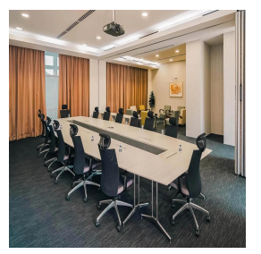
Phuket - Thailand