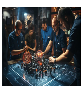
Maintenance Training and Engineering Training Courses