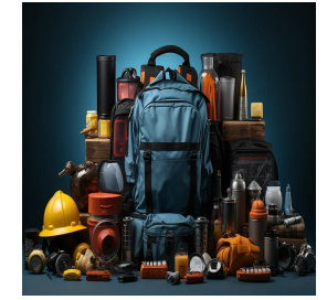
Occupational Health, Safety and Security Training Courses