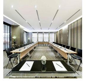
Bangkok - Thailand