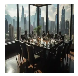
Kuala Lumpur -Malaysia