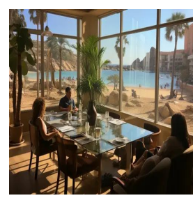
Sharm El-Sheikh -Egypt