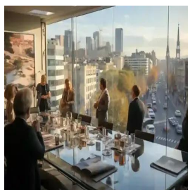
Madrid - Spain