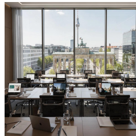
Berlin - Germany