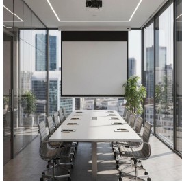
Frankfurt - Germany