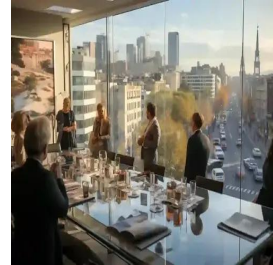
Madrid - Spain