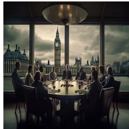
London - UK