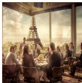
Paris - France