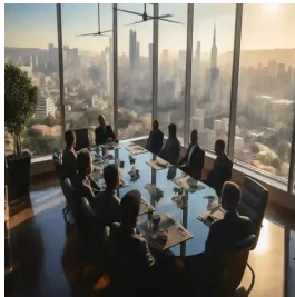
Baku - Azerbaijan