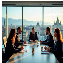
Munich - Germany