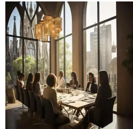
Barcelona - Spain