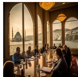
Istanbul - Turkey