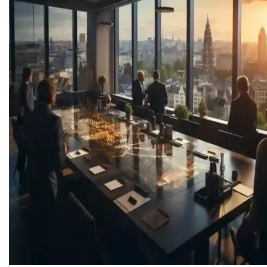
Amsterdam - Netherlands