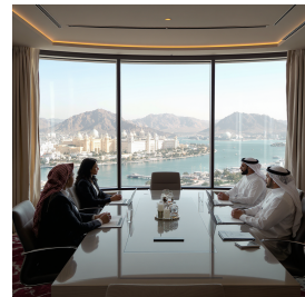
Muscat - Oman