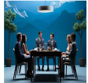
Human Resources Training and Development Courses