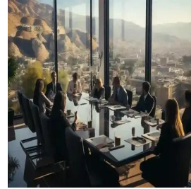
Tbilisi - Georgia