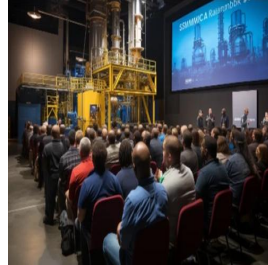
Oil & Gas Training and Other Technical Courses