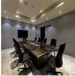
Accra - Ghana