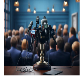
Communication and Public Relations Training Courses