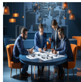
Legal Training, Procurement and Contracting Courses