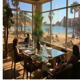
Sharm El-Sheikh - Egypt