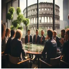
Rome - Italy