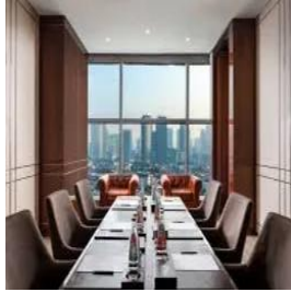
Jakarta - Indonesia