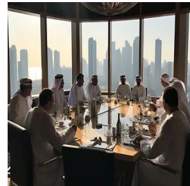
Manama - Bahrain