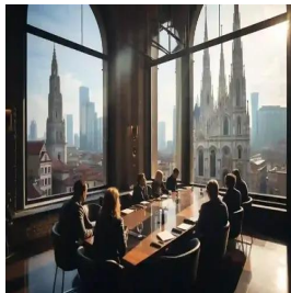
Milan - Italy