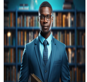
Personal & Self-Development Training Courses