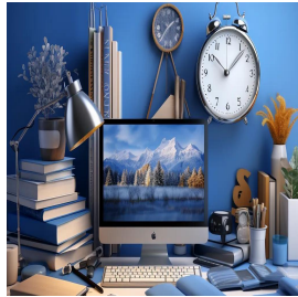
Secretarial and Administration Training Courses