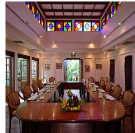
Zanzibar - Tanzania