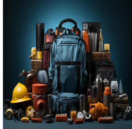
Occupational Health, Safety and Security Training Courses