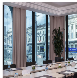
Geneva - Switzerland