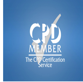
Certified Courses By International Bodies