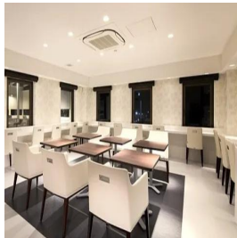
Tokyo - Japan