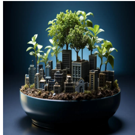
Environment & Sustainability Training Courses