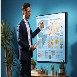
Marketing, Customer Relations, and Sales Courses