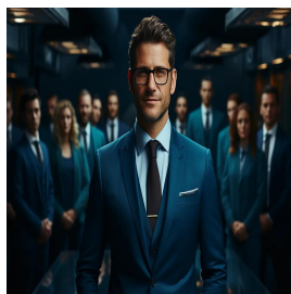
Leadership and Management Training Courses