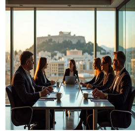
Athens - Greece