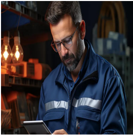
Quality and Operations Management Training Courses