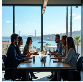
San Diego - USA