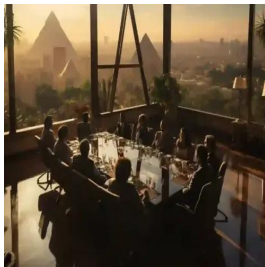
Cairo - Egypt