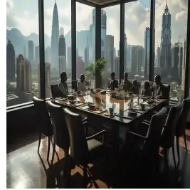
Kuala Lumpur - Malaysia