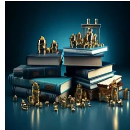
Governance, Risk and Compliance Training Courses