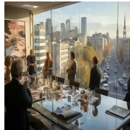
Madrid - Spain