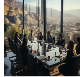
Amman - Jordan