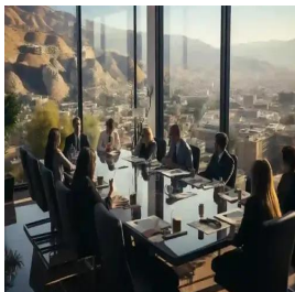
Amman - Jordan