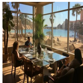
Sharm El-Sheikh - Egypt