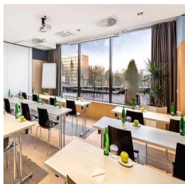
Prague - Czech Republic