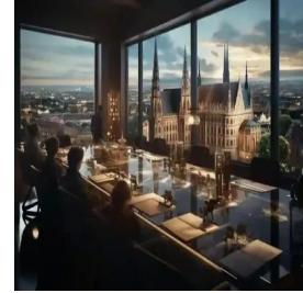
Vienna - Austria