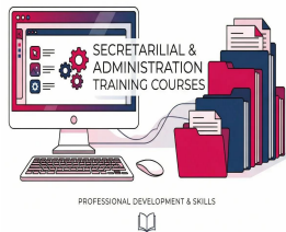
Secretarial and Administration Training Courses