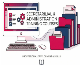
Secretarial and Administration Training Courses