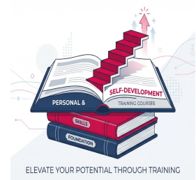
Personal & Self-Development Training Courses