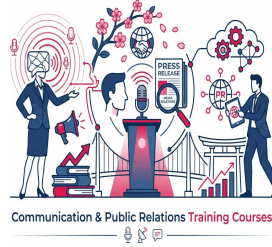
Communication and Public Relations Training Courses