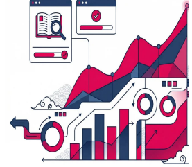
Data Analytics Training and Data Science Courses