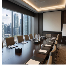
Toronto - Canada