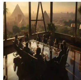
Cairo - Egypt