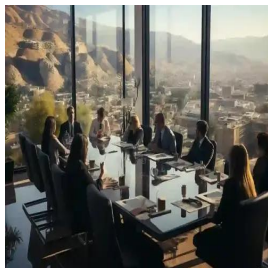
Amman - Jordan