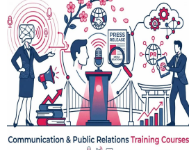
Communication and Public Relations Training Courses