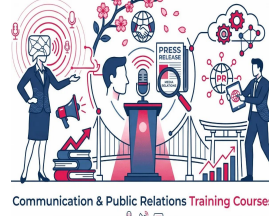
Communication and Public Relations Training Courses