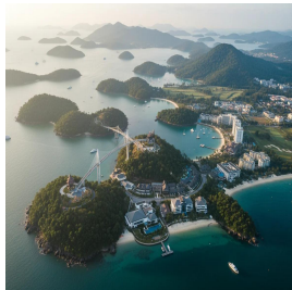
Langkawi - Malaysia