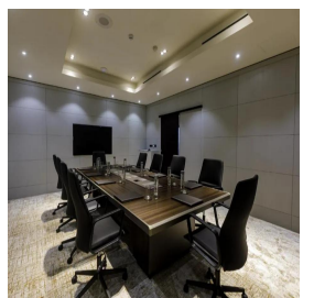
Accra - Ghana