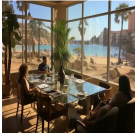
Sharm El-Sheikh -Egypt