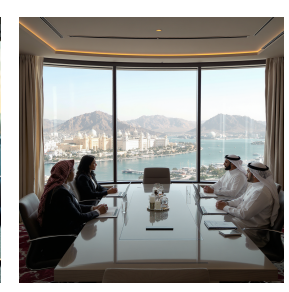
Muscat - Oman