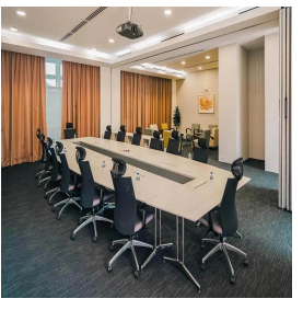
Phuket - Thailand