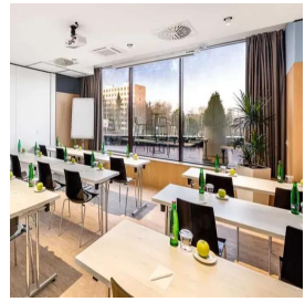
Prague - Czech Republic