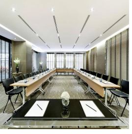
Bangkok - Thailand