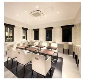
Tokyo - Japan