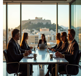
Athens - Greece