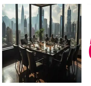
Kuala Lumpur -Malaysia