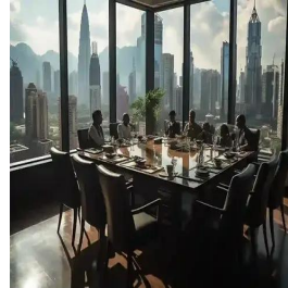
Kuala Lumpur - Malaysia