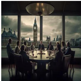
London - UK