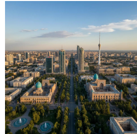
Tashkent - Uzbekistan