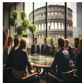
Rome - Italy