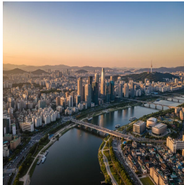
Seoul - South Korea