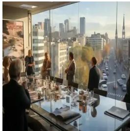
Madrid - Spain