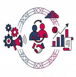
Marketing, Customer Relations, and Sales Courses