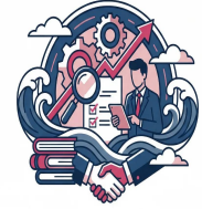
Quality and Operations Management Training Courses