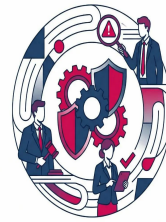
Governance, Risk and Compliance Training Courses