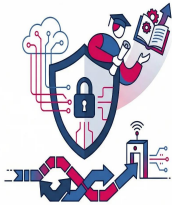
IT Security Training & IT Training Courses