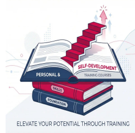
Personal & Self-Development Training Courses