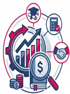
Finance and Accounting Training Courses