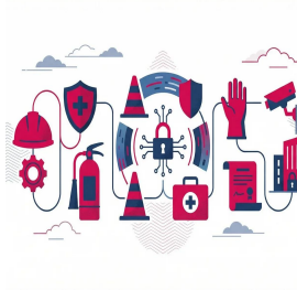
Occupational Health, Safety and Security Training Courses