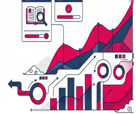
Data Analytics Training and Data Science Courses