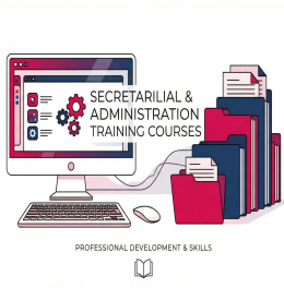
Secretarial and Administration Training Courses