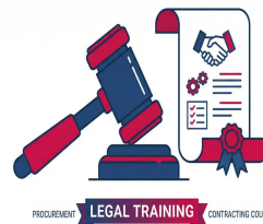
Legal Training, Procurement and Contracting Courses