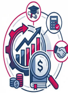
Finance and Accounting Training Courses