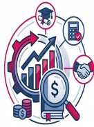
Finance and Accounting Training Courses