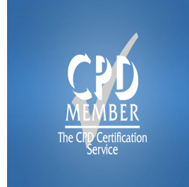
Certified Courses By International Bodies