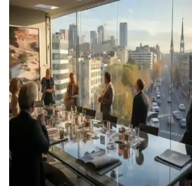
Madrid - Spain