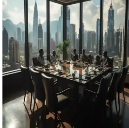
Kuala Lumpur - Malaysia