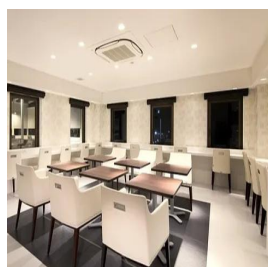
Tokyo - Japan