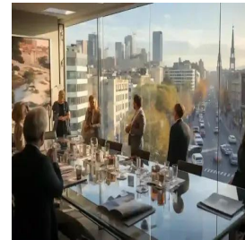
Madrid - Spain