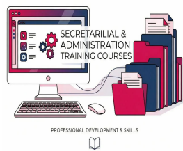
Secretarial and Administration Training Courses