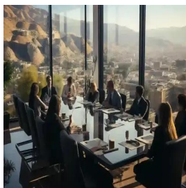
Tbilisi - Georgia