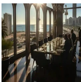
Casablanca - Morocco