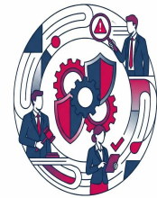
Governance, Risk and Compliance Training Courses