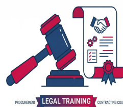
Legal Training, Procurement and Contracting Courses