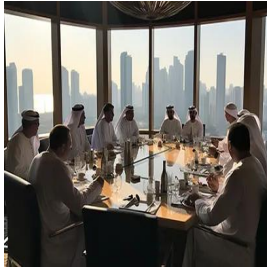
Manama - Bahrain