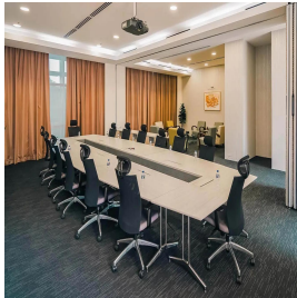
Phuket - Thailand