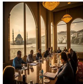
Istanbul - Turkey