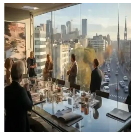
Madrid - Spain