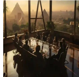
Cairo - Egypt