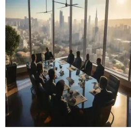
Baku - Azerbaijan