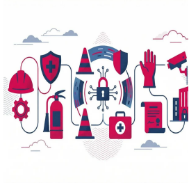
Occupational Health, Safety and Security Training Courses