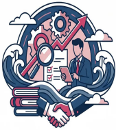
Quality and Operations Management Training Courses