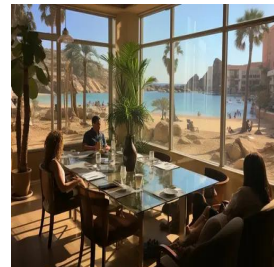
Sharm El-Sheikh - Egypt