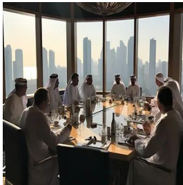
Manama - Bahrain