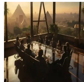
Cairo - Egypt