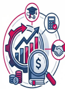
Finance and Accounting Training Courses