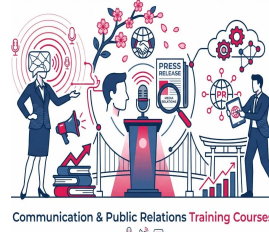
Communication and Public Relations Training Courses